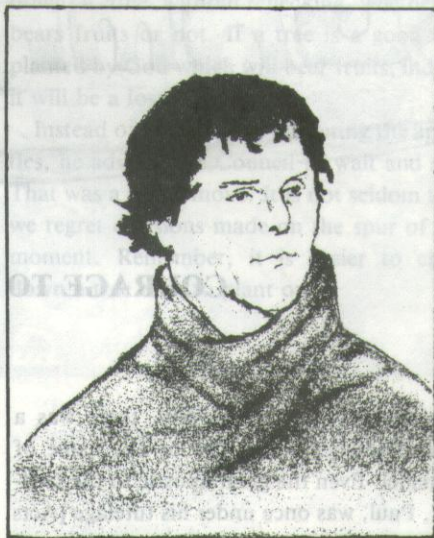
MARTIN LUTHER - The First Reformer

ize the responsibility to bring the whole truth to the whole world. In order to fulfill God's plan of salvation, we must be self-sacrificing. Are we ready?