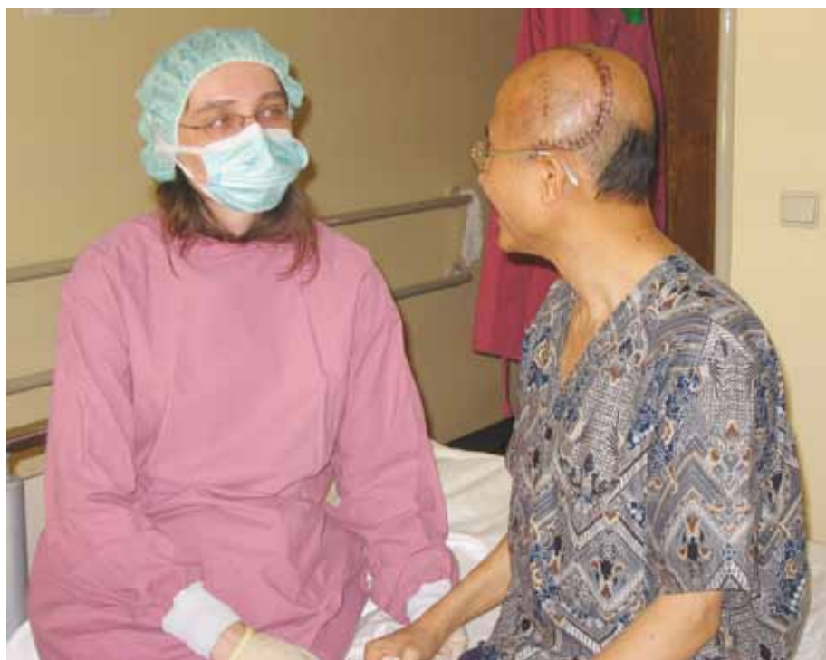
My wife and I in the hospital after I was healed.

I stayed in the hospital for over a week after the surgery. During this time, I did not undergo any type of therapy because I was completely healed—I could walk, talk, and write. Due to an infection I acquired at the hospital, I was isolated in my own room and all visitors had to wear gowns, masks, and gloves. My wife and I got to spend a lot of time together and experience another honeymoon because of this.