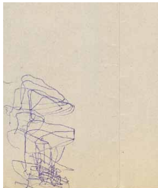
The “masterpiece” I produced after the May 22 surgery.

Even so, I enjoyed being a preacher and thanked God for allowing my life to go so smoothly. But now, I believed that I had completed the work that had been entrusted to me as a preacher, and I felt a great freedom in this.