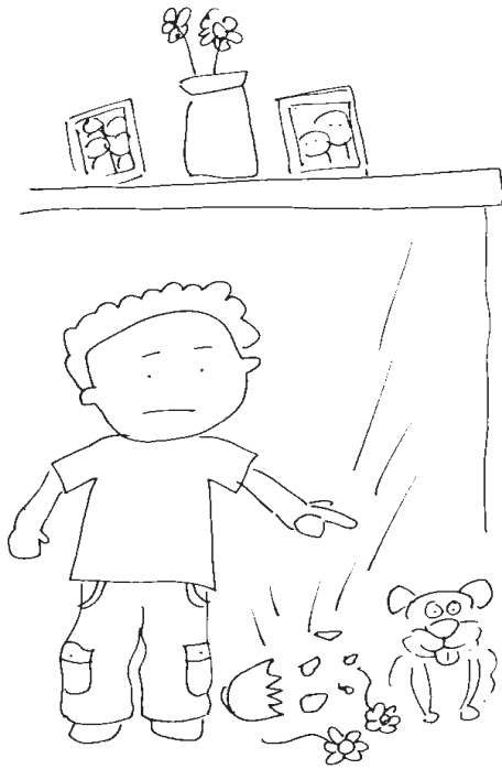
"It was the dog who did it."

Look at each set of pictures. Which people obeyed God by telling the truth? Which ones did not? Put an "X" over the people who did not.