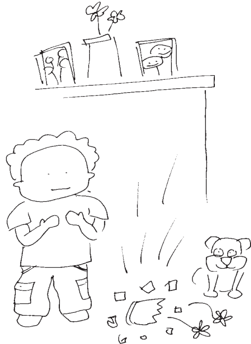
"I broke it. I am sorry."