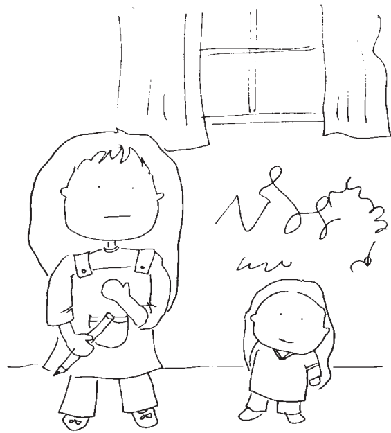
"I drew on the wall. I am sorry!"