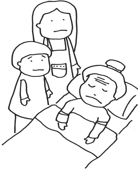
1. Grandma is feeling very sick.

Look at each picture. How is each person feeling? How can Jesus help them? How can they thank God after they are well?