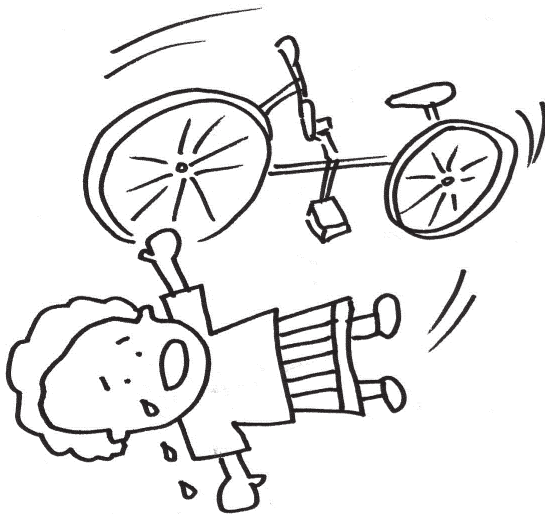
3. A neighbor falls off his bike . and is hurt.