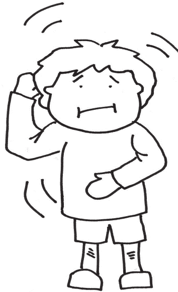
2. Your good friend is sick.