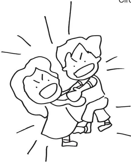
1. They are fighting.