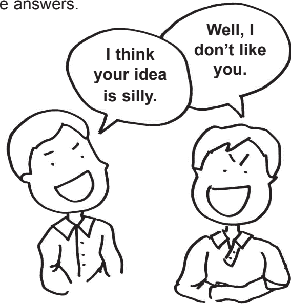
2. They are arguing.