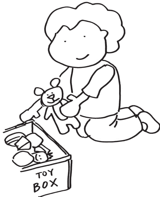
4. He is putting his toys away.