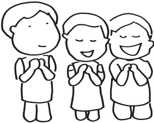
3. He is praying with his eyes open.