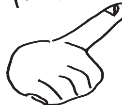
The king sees fingers drawing words on the wall.