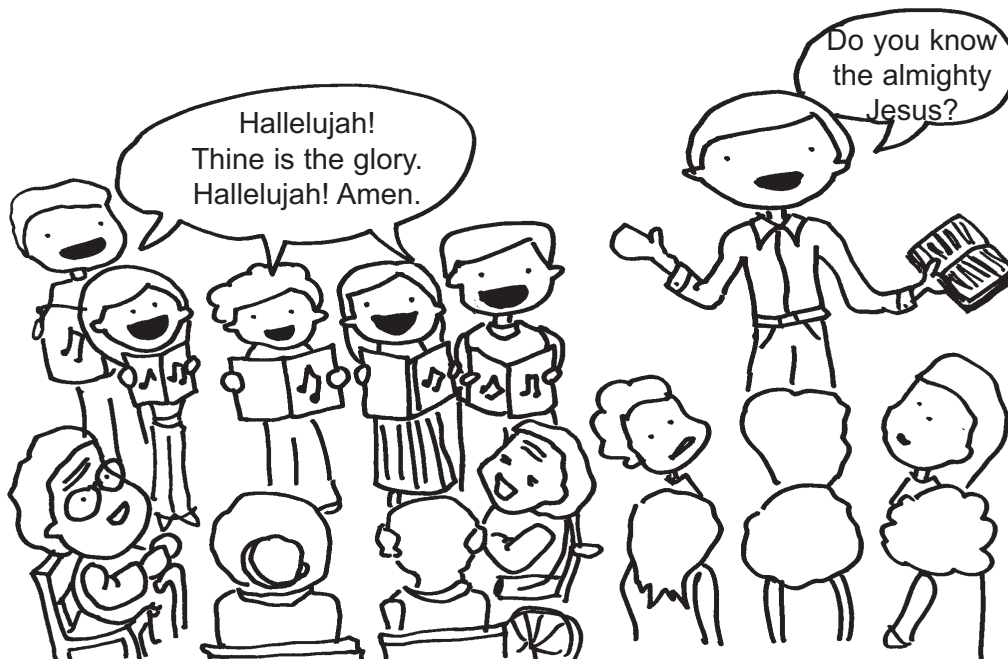
3. A choir can sing hymns.