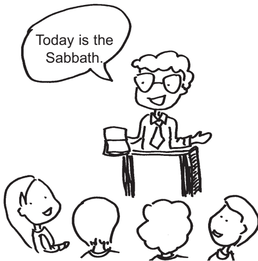
1. A pastor talks about God at church.

We can pray for those who tell others about Jesus. What kinds of people can preach about Jesus? What are they saying about Jesus? Can you do that?