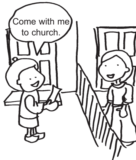
2. We can talk to our neighbor.