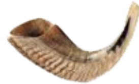
Prophet's Oil Horn