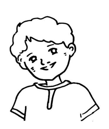
The Widow's Son