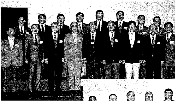
IA Exco Members