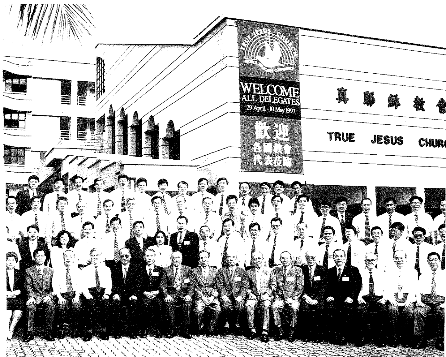
Delegates Group Photo