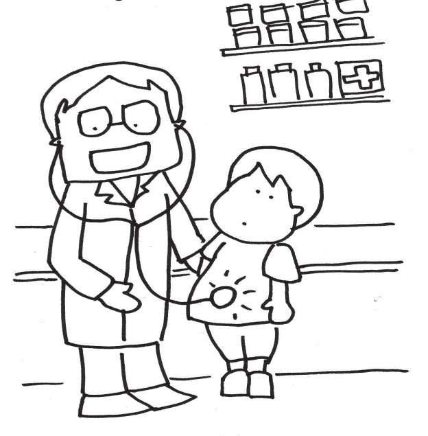
4. Your sister is in the hospital.