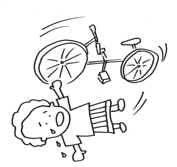
3. A neighbor falls off his bike . and is hurt.