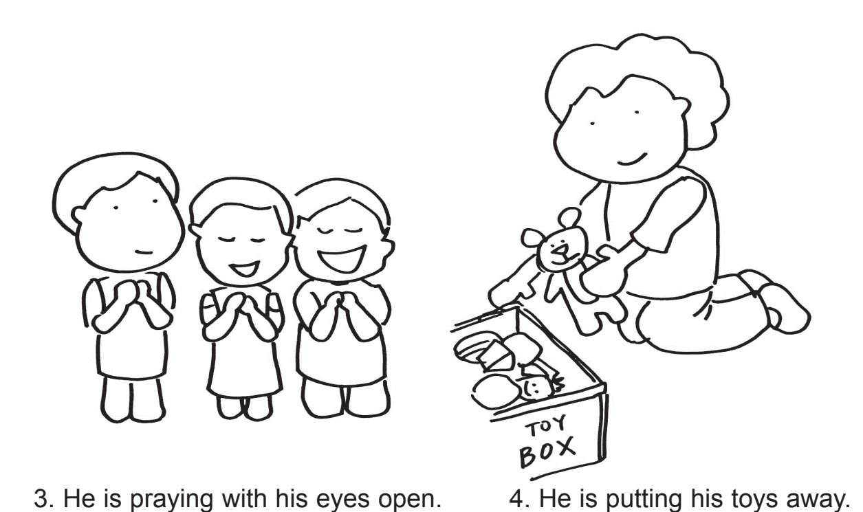
Obeying God Disobeying God Disobeying God