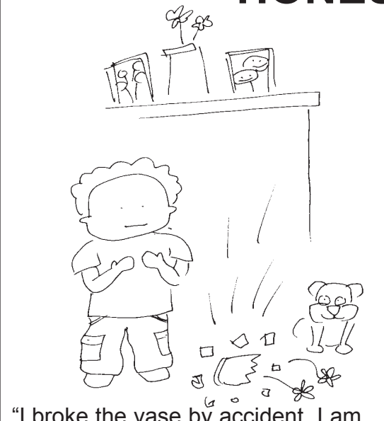
"I broke the vase by accident. I am sorry."