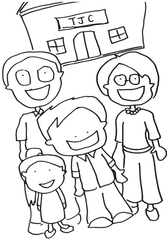
1. We can come to church.

What are some of the things we can do because we believe in God?