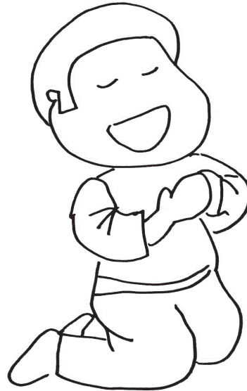
2. We can pray to God.