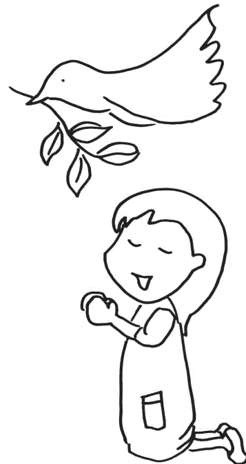
4. We can pray for the Holy Spirit.