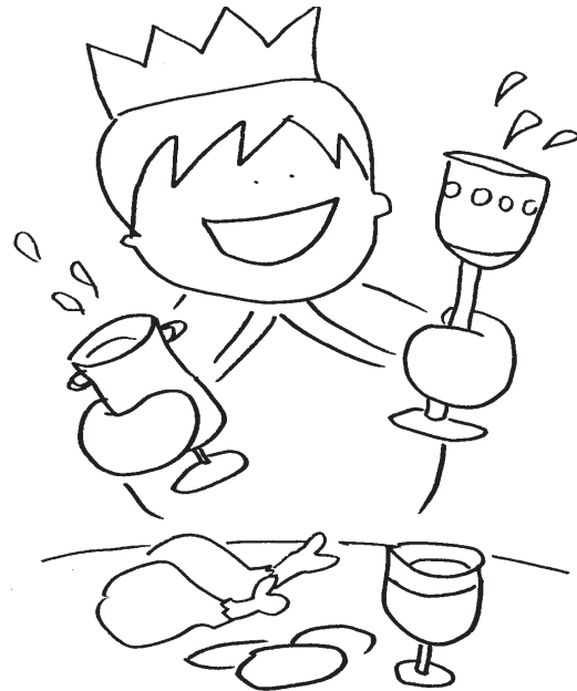
The king has a feast and uses the cups from the temple.