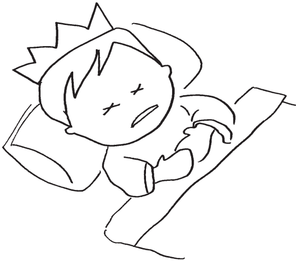
King dies that night.

Look at the pictures. Which one happened first? Put them in the right order.