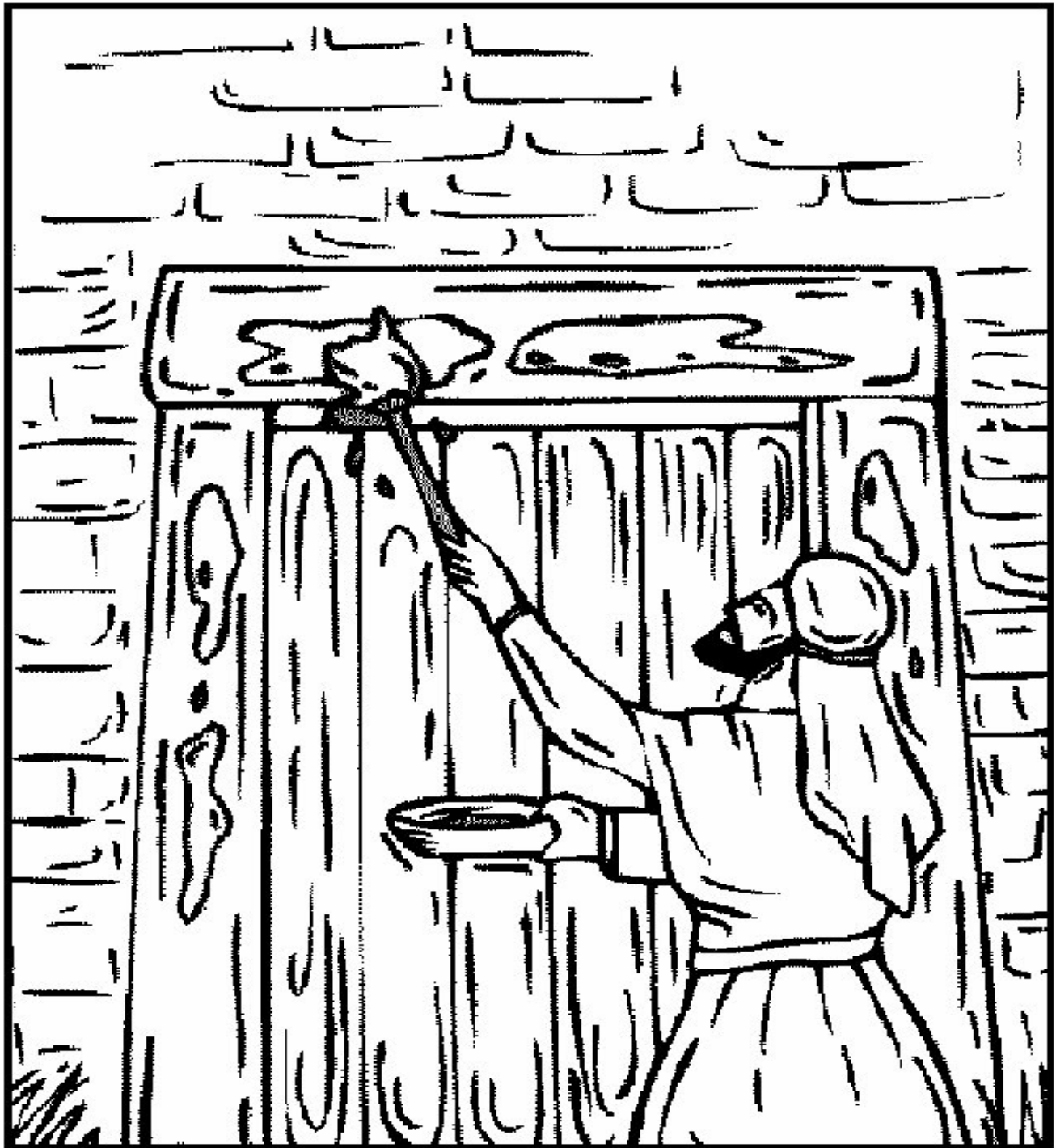
Blood on the Door