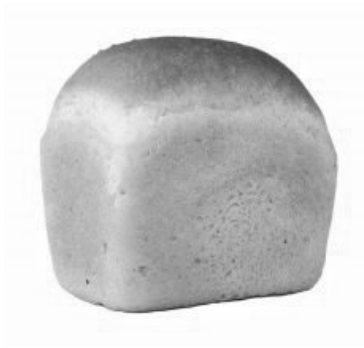
Loaf of Bread