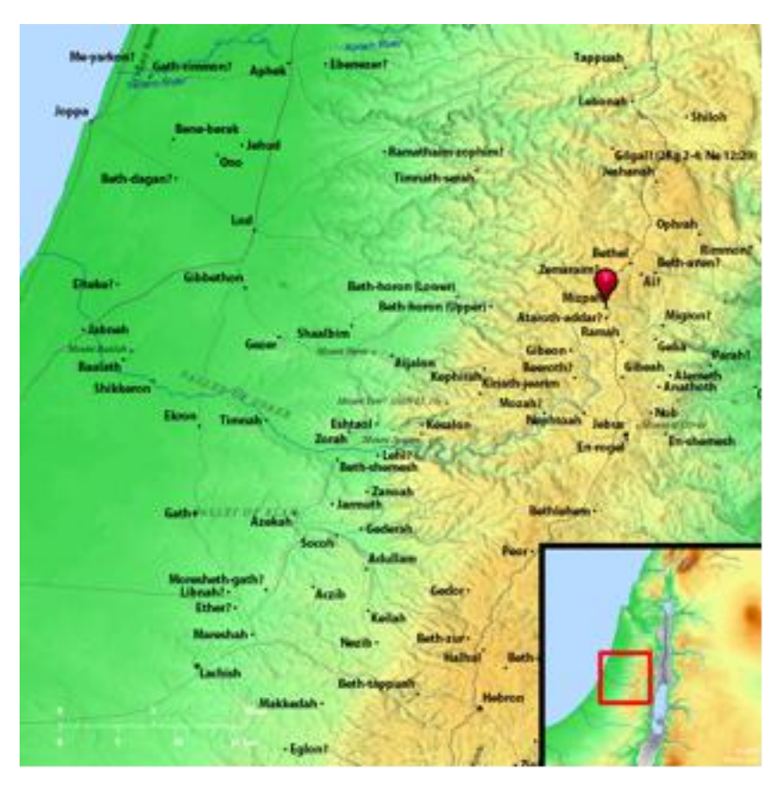
Map of Naioth (indicated by the pin)