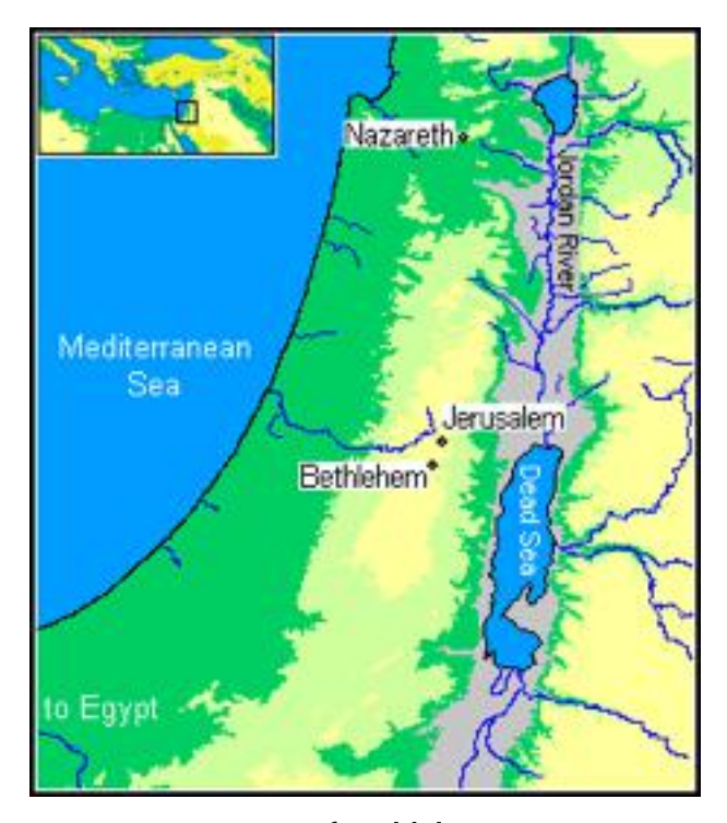
Map of Bethlehem