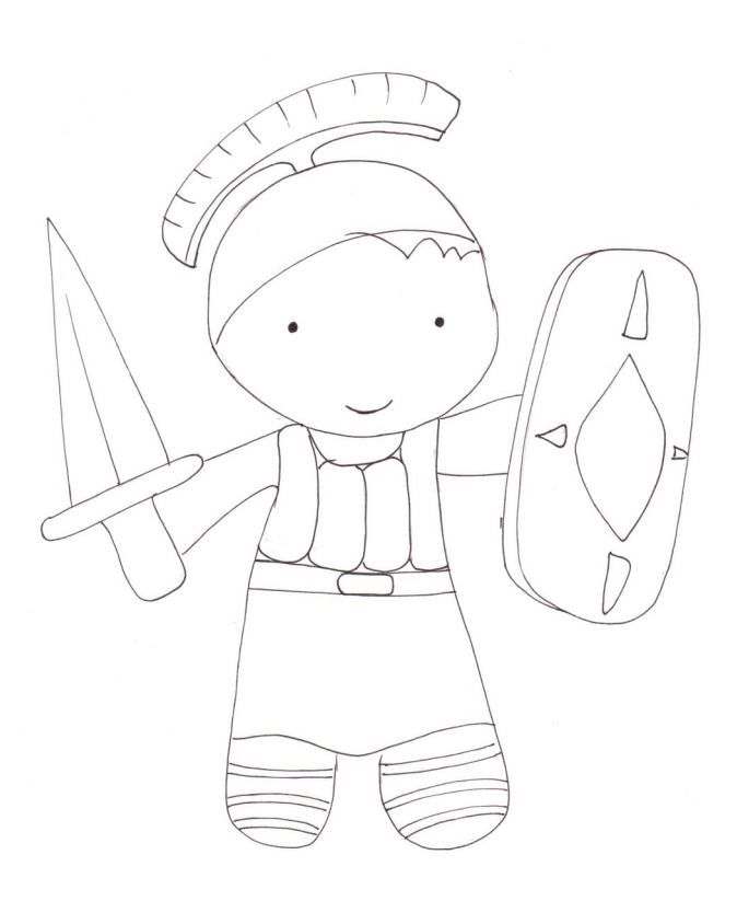
"Put on the whole armor of God, that you may be able to stand against the wiles of the devil."