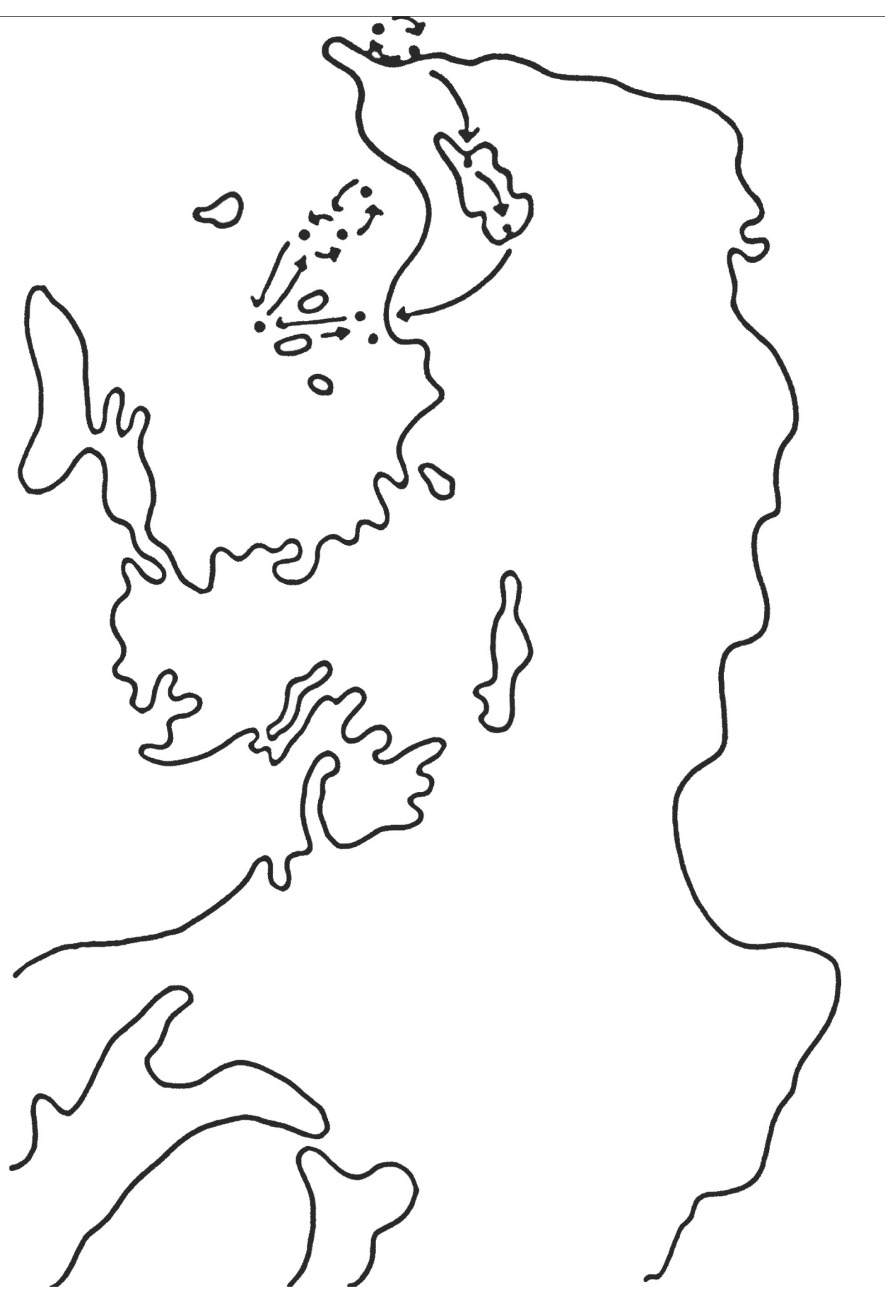
Paul's First Missionary Journey