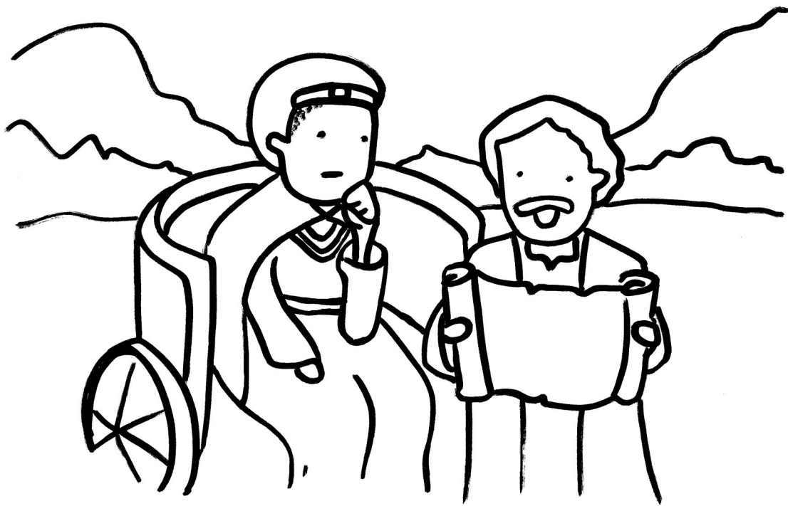
Illustration 1: Philip Preaching to the Eunuch