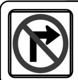
Family Rule #2