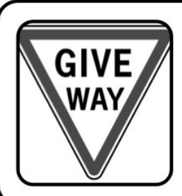
Family Rule #1

Can you list a few family rules at home? Can you think of a reason why these rules are in place?