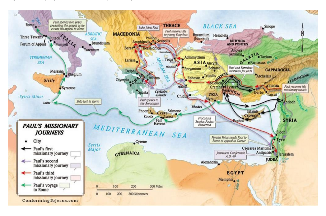
Figure 3: Map of Paul's Missionary Journeys<sup>2</sup>