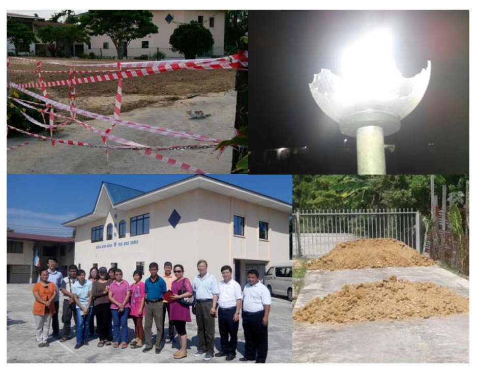
Clockwise from top left: Access road to church blocked by iron chain; broken lamp, access road blocked by rubble; True Jesus Church in Papar.

pretending. But I replied, "It is our God who has started to work."