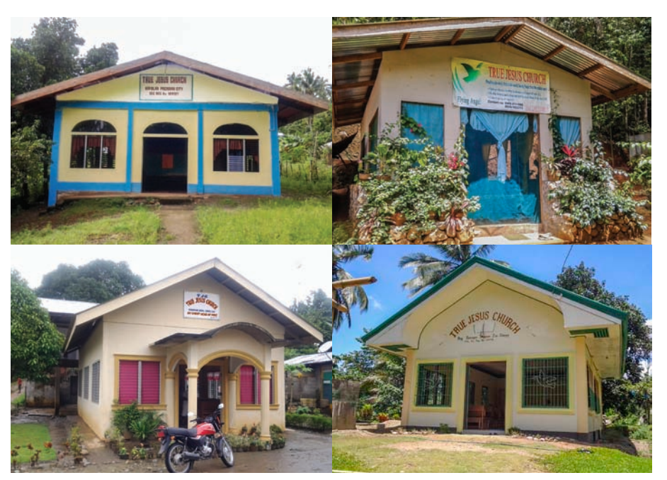
Clockwise from top left: True Jesus Church in Napolan, Eden, Bantungan and Bayog.

to the church in Pagadian to study the doctrines of the true church. The churches in Maculay, Laperian and Tabina were established through radio evangelism.