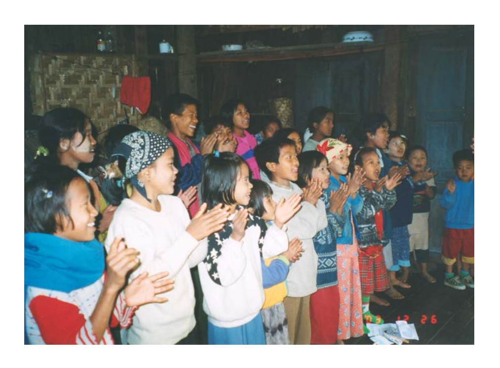
faith which is in Christ Jesus.