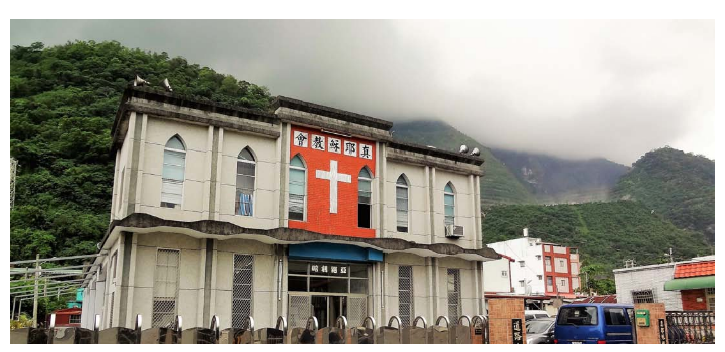
True Jesus Church in Fushi.

The angel brought them to a broken hanging bridge that had been marked as unsafe and off-limits. He spoke to those behind him, "Pay attention to where I put my feet; if you step where I do, you'll be safe." Not long after, their pursuers came after them. But they were afraid to cross the rickety bridge. God