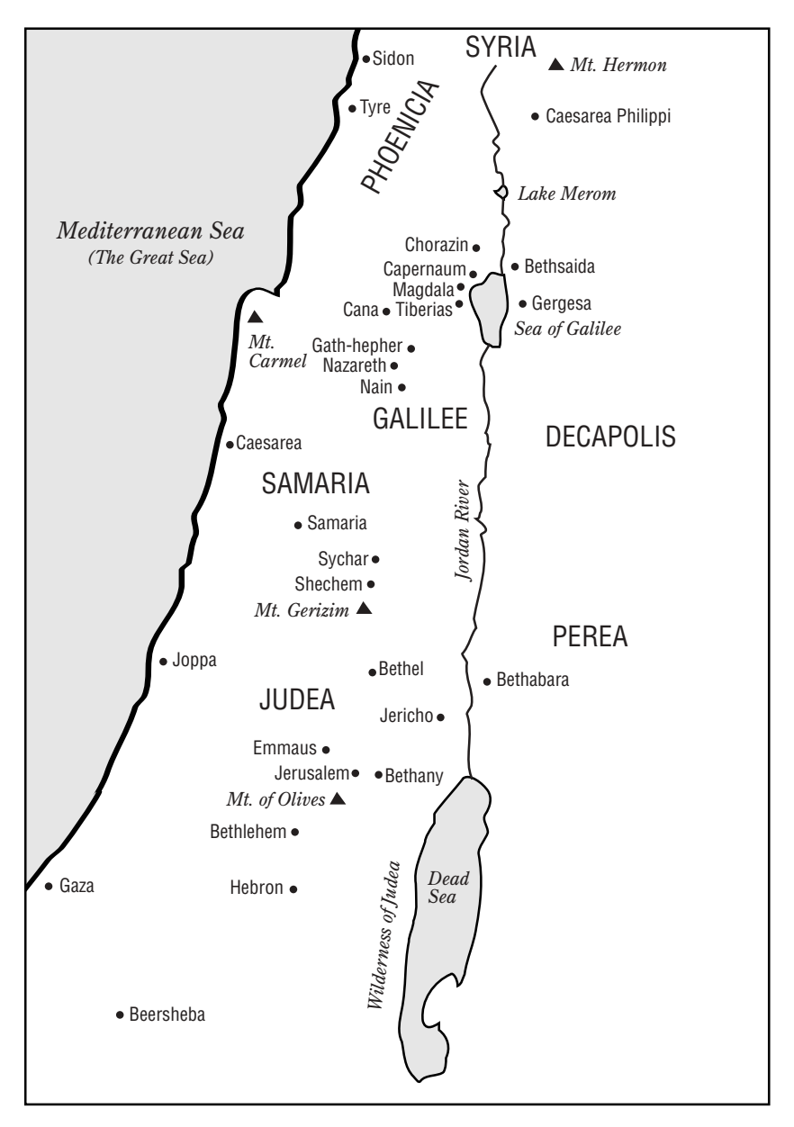
Map A Palestine in the time of Christ <sup>2/12</sup>